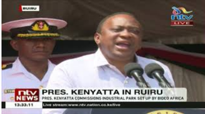
Only God knows who will be president after me, I don't mind - Uhuru