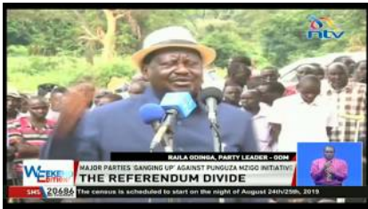
Major parties 'gang up' against Punguza Mzigo initiative