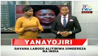
BREAKING NEWS: Governor Joyce Laboso is dead