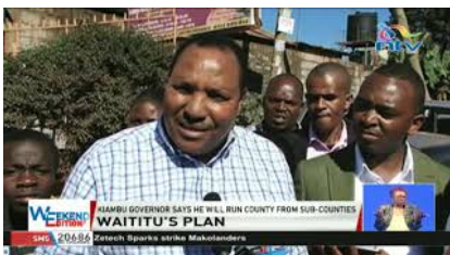
I will operate Kiambu county affairs at sub-county level - Governor Waititu