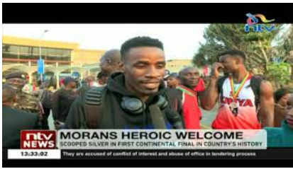
Kenya Morans scoop silver in first continental final in country history